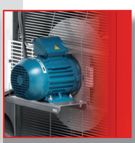
Radial fan (CPC 40-60 G)

Unique 4/6 screw profile for premium performance.