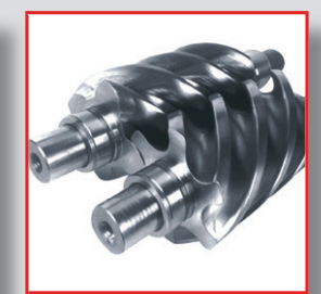
In-house designed air ends

Unique 4/6 screw profile for premium performance.