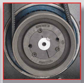
In-house designed transmission

Unique 4/6 screw profile for premium performance.