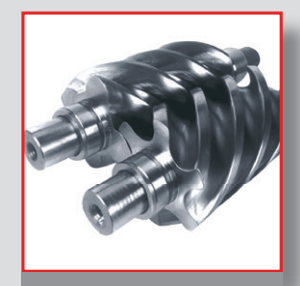
In-house designed air ends

Unique 4/6 screw profile for premium performance.