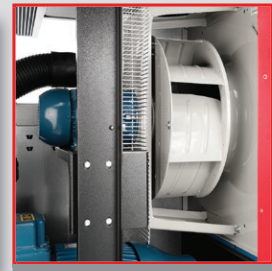
Radial fan (optional)

Saves up to 30% thanks to perfect match between air demand and air supply.