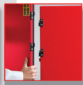
Easy service and accessibility

Qualified, high quality reputed components.