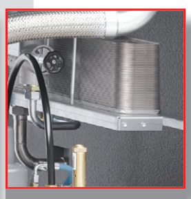
Energy recovery (optional)

Saves space and guarantees top air quality