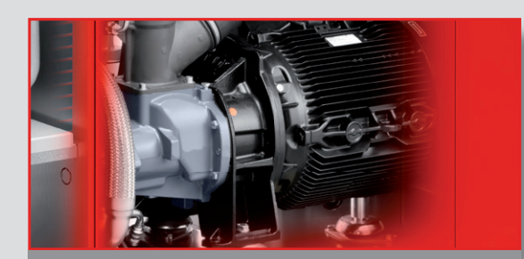
Maintenance-free drive train